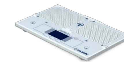
TRACKMAN™ (Ref. F70301)