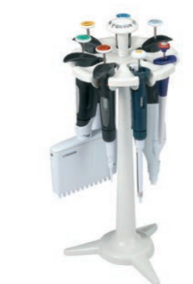
CARROUSEL™ pipette holder (Ref. F161401)

Good Laboratory Practice (GLP) features ensure the high quality and reliability of your work.