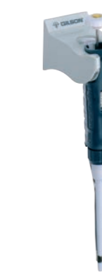
SINGLE™ pipette holder (Ref. F161406)