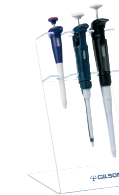
TRIO™ pipette holder (Ref. F161405)